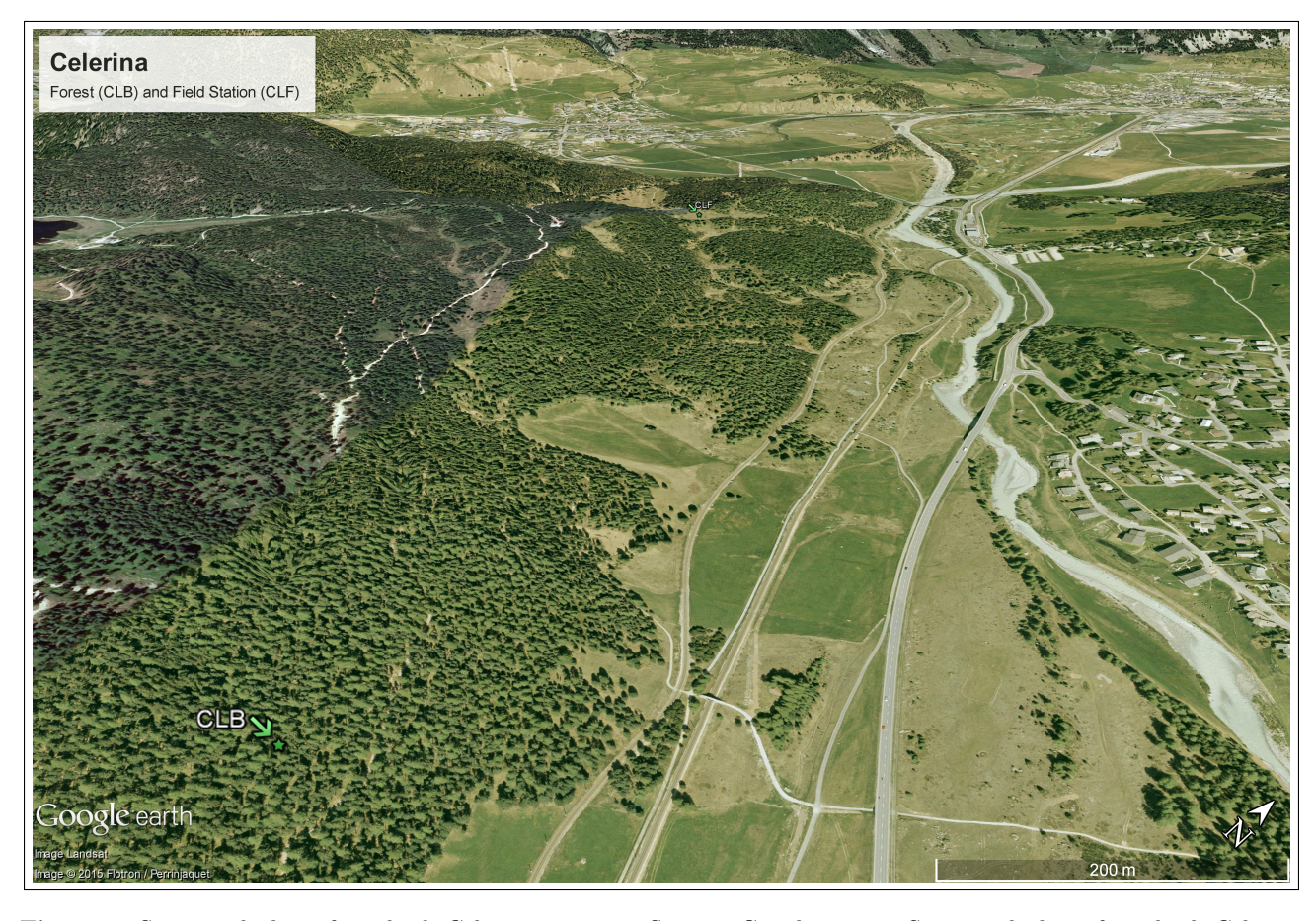
Figure 1: Site aerial photo from both Celerina stations.

The measurements were carried out at Celerina in the Swiss Canton of Grisons, in the high valley called Engadin belonging to the main ridge of the Alps (Fig. 1). Time series of two plots have been recorded, one within the forest (Fig. 2a) and a second one outside of the forest (field station, Fig. 2b). Tab. 1 shows further details on the research station characteristics.