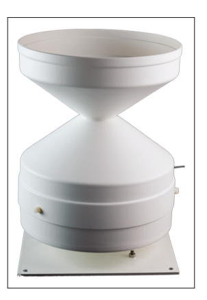
Figure 4: Precipitation sensor