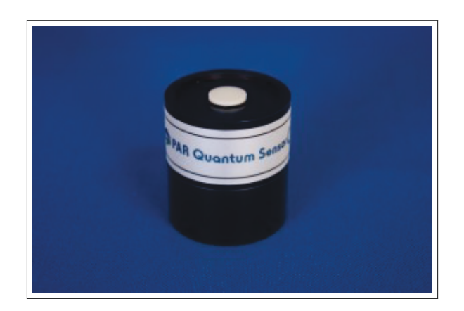
Figure 5: PAR sensor