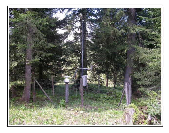
Figure 2: ALB: Forest station