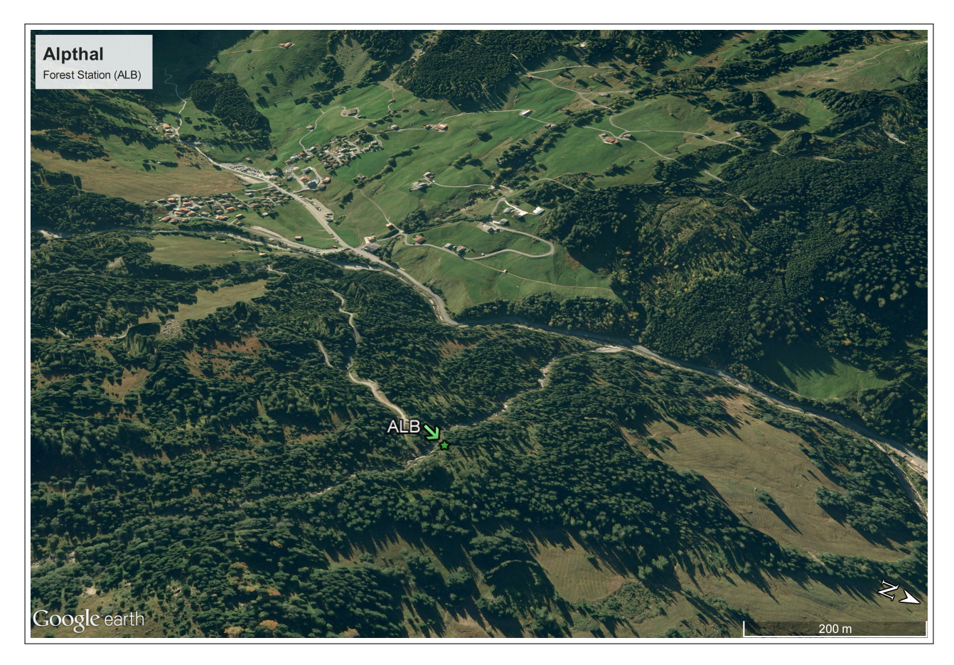
Figure 1: Site aerial photo from the Alpthal forest station.

The measurements were carried out at Alpthal in the Swiss Canton of Schwyz in the northern Prealps (Fig. 1). Time series of one plot within the forest have been recorded (Fig. 2). Tab. 1 shows further details on the research station characteristics.