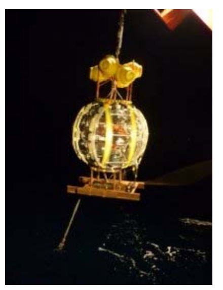
Fig. 1: First deployment of the compact mooring