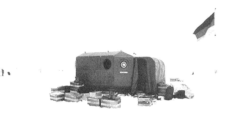
Fig. 2: The cabin of the Filchner Station. Abb. 2: Die Wohnkabine der Filchner-Station.

operations. Careful inspection of satellite images and ice charts from the last decade had already shown that a shore lead opens up every summer along the barrier. The ice-free channel should be used and explored during our expedition.