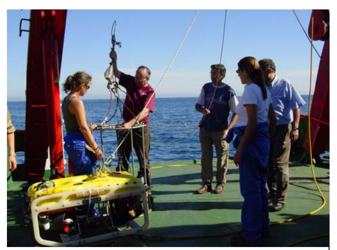
Fig. 3 Preparation of the deployment of ROV "Falcon" on board.

The underwater images were recorded by using a "Falcon" ROV supplied by the German enterprise FIELAX