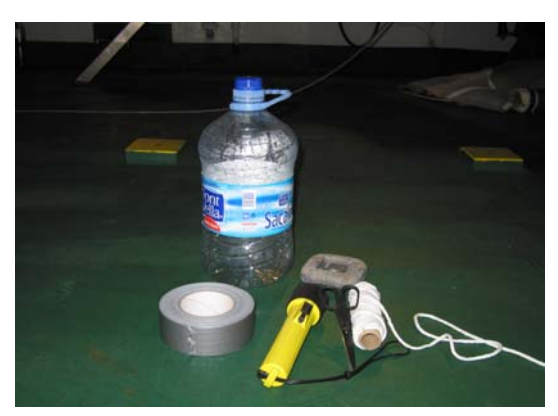
Fig. 8 Two of the carried out activities: polystyrene balls exposed to underwater pressure. Light trap to capture zooplankton

One of the main objectives of the ICM outreach projects is the dissemination and popularization of oceanography science which is a duty and a need for scientific and education Institution everywhere. The ICM plans will focus in to increase our participation in outreach programs and look for new approaches of communicate and disseminate our scientific results. During the CORAL II cruise a new project was undertake (Fig. 8). Information about the cruise was daily shown in the web page <a href="http://www.utm.csic.es">http://www.utm.csic.es</a> by the cruise leader and scientists. At the same time, one student on board informed to their colleagues and friends at the school via the web page http://www.funcaciocollserola.com/mediterrania. Each day, a group of students and professors phone him and make questions about the cruise and research on board. All these conversations are now available, together with other texts, pictures and videos in the last mentioned web page.