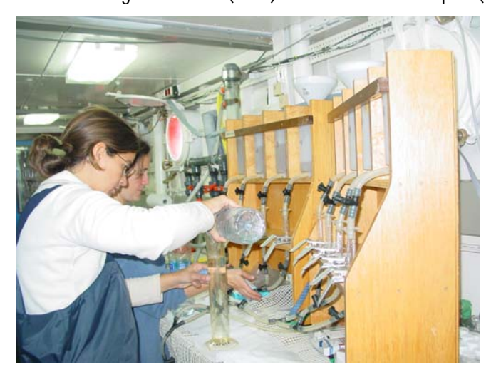
Fig. 6 Filtration of Seawater on board for Particulate Organic Carbon (POC) and Lipid analysis.

The CTD was equipped with a Rosette and water samples were also taken in order to analyse the Particulate Organic Carbon (POC) and the content on Lipids (Fig. 6).