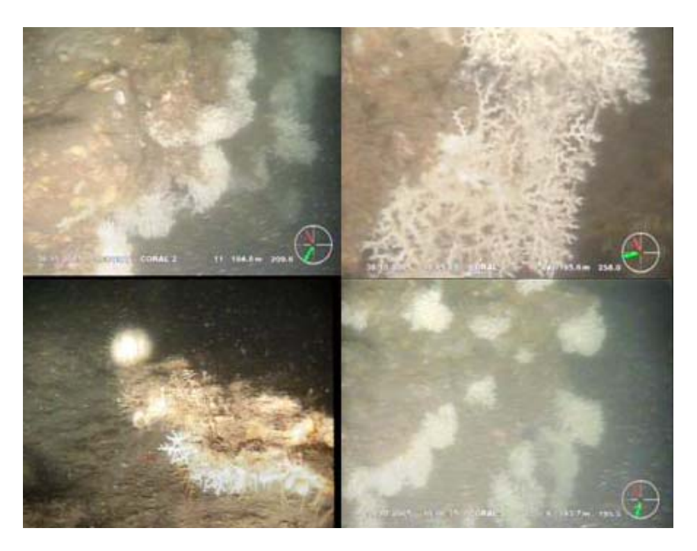
Fig. 5 Four views from a Madrepora oculata community in the area cover by transect number 6 (see Fig. 4). All images were recorded by approx. 200 m depth.