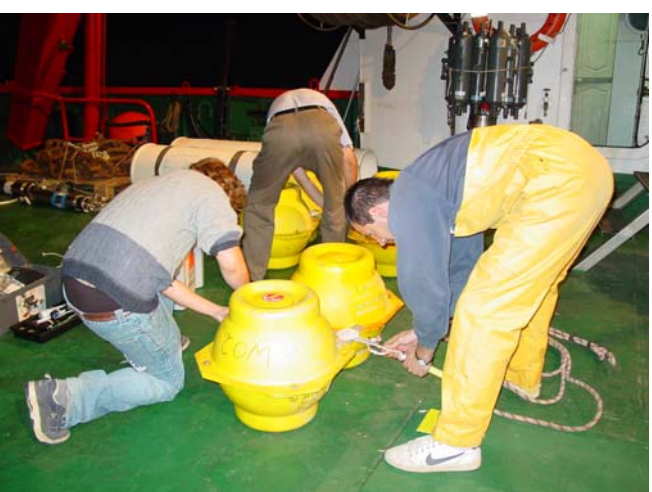
Fig. 2 Deployment of moorings in the Cap de Creus Canyon on board of the RV García del Cid.